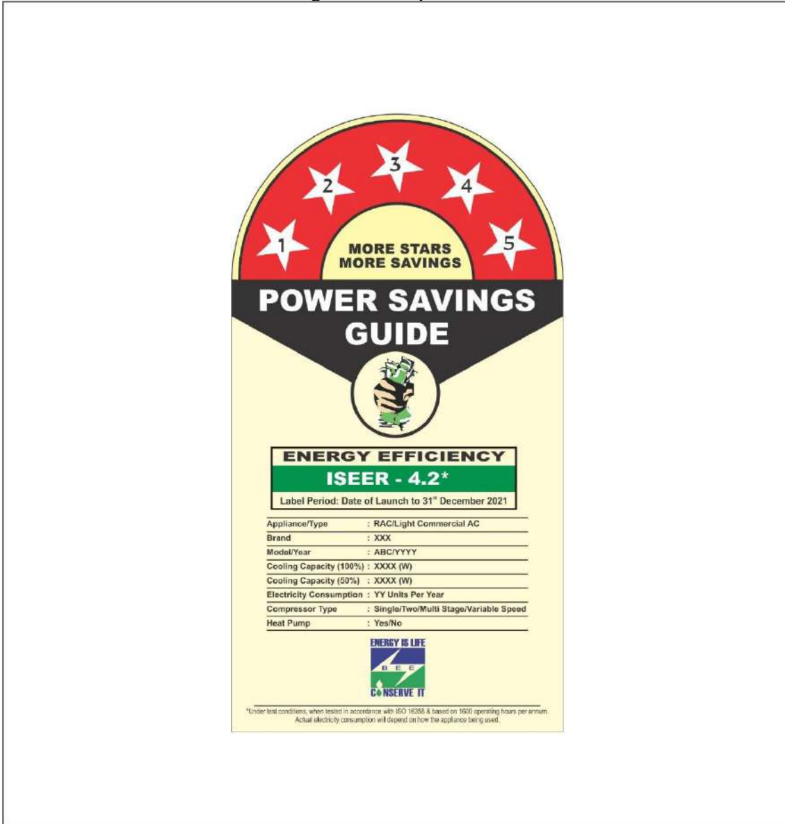
Figure 3: Sample Label

An example of a printed star label to be affixed on the model is shown in Figure 3.